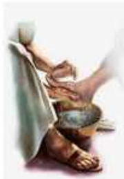
"You should wash each other's feet" (John 13:34)